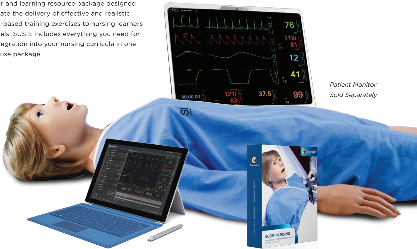
Patient Monitor Sold Separately

SUSIE is an advanced, wireless and tetherless patient simulator and learning resource package designed to facilitate the delivery of effective and realistic scenario-based training exercises to nursing learners of all levels. SUSIE includes everything you need for rapid integration into your nursing curricula in one easy-to-use package.